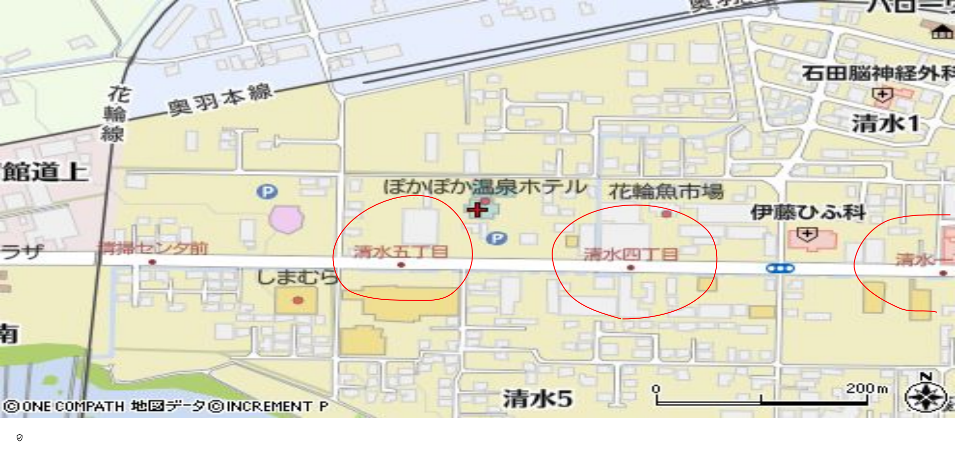
There are many bus stops with "Shimizu" nearby